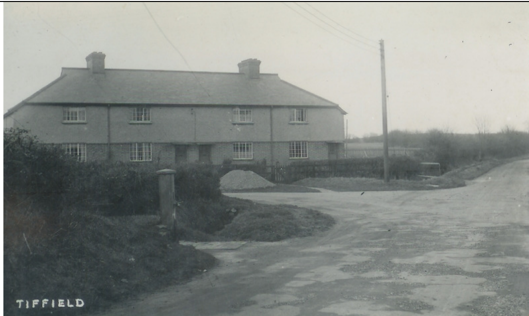
Council Houses at corner of High Street North and Eastcote Road. Note pump in verge and ditch beside the road. No footpaths, streetlights or white lines.