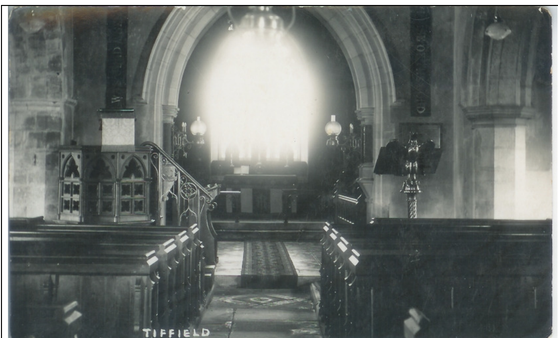
Interior view of Church