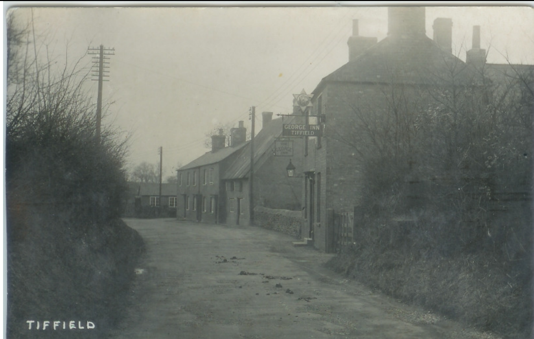
The George Inn with Northampton Brewing Company (NBC) star, two hanging signs and lantern overhanging entrance. This is before the pub was extended and you can see the stone wall where the hedge is now. Also in the distance is the chapel at what is now the bottom of Meadow Rise. Also note the multiple phone lines. No footpaths, streetlights or white lines.