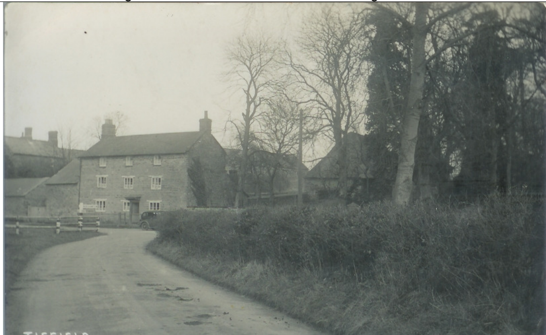
Bridge House Farm. Similar view as now but before new bridge was built. Note finger sign and old car.