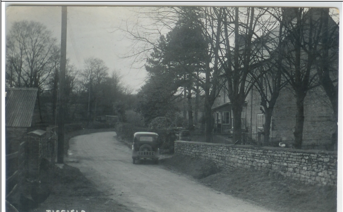
South View Farm with old car parked outside. No footpath and pre Pigeon Hill