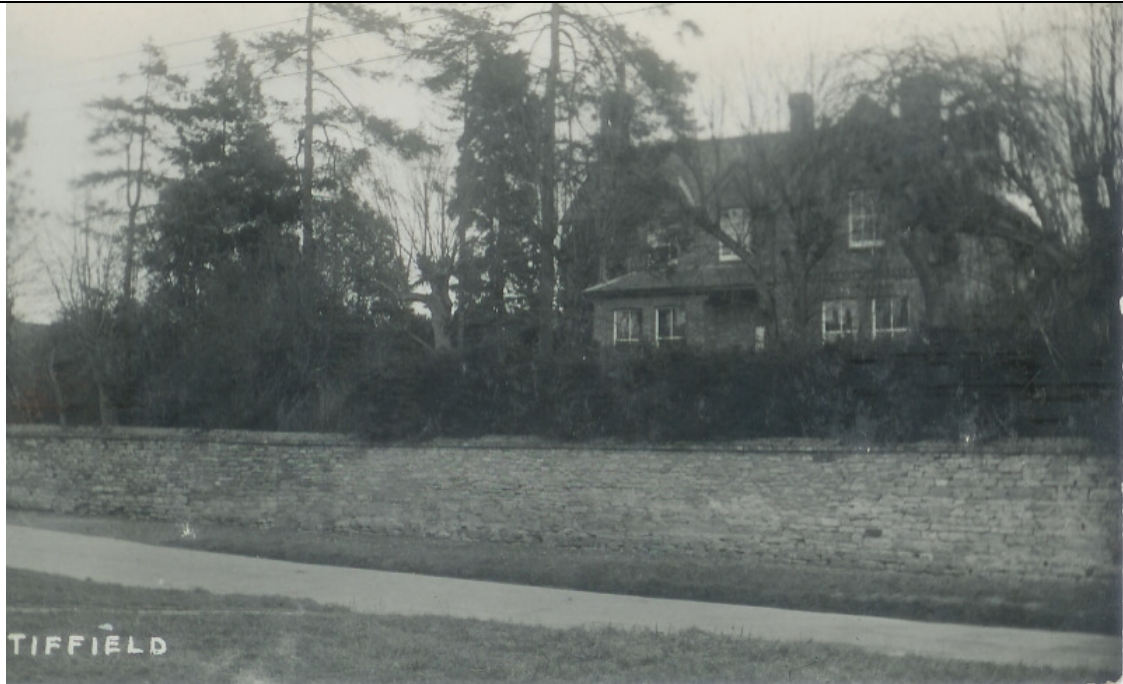
Manor Farm. Hedge lower than now and more trees in garden.